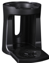
STAND ASSY KIT, TF SERVER